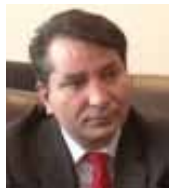
Pal Lekaj Mayor of Gjakova