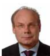
Pierre Pribetich Vice Mayor of Dijon Council of Europe