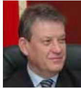
Zarko Pavicevic Mayor of Bar