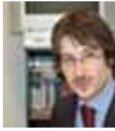
Roman Doubrava DG Energy