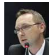
Ermin Hajder Mayor of Bosanski Petrovac