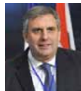
Ivailo Kalfin European Parliament