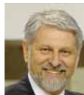
Stevco Jakimovski Mayor of Karpos